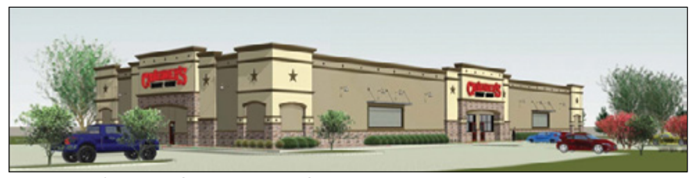
Rendering of the new Cavender's Boot City store.