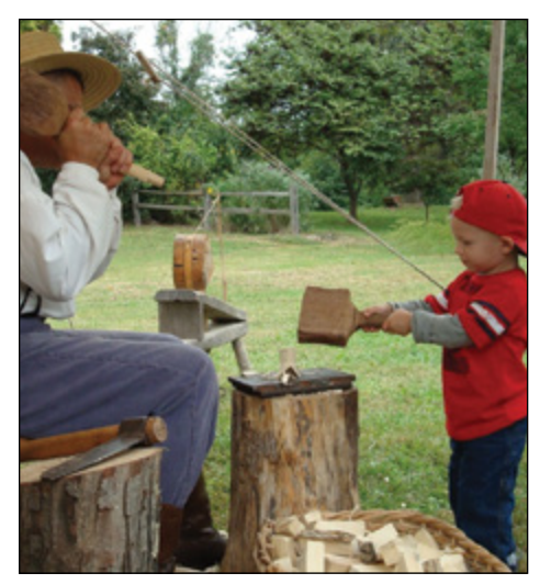
Kids woodworking at the Heritage Festival.