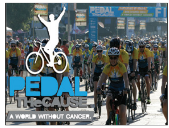
Pedal the Cause has moved to the Chesterfield Amphitheater from Downtown St. Louis.

Everyone can join the fight against cancer — with six different ride Pedal the Cause has distances, a virtual rider option, and volunteer opportunities, there is truly something for everyone.