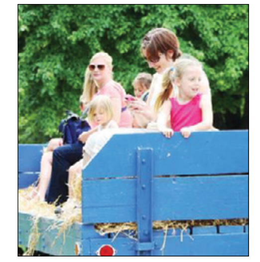
Hayrides included in Festival admission.