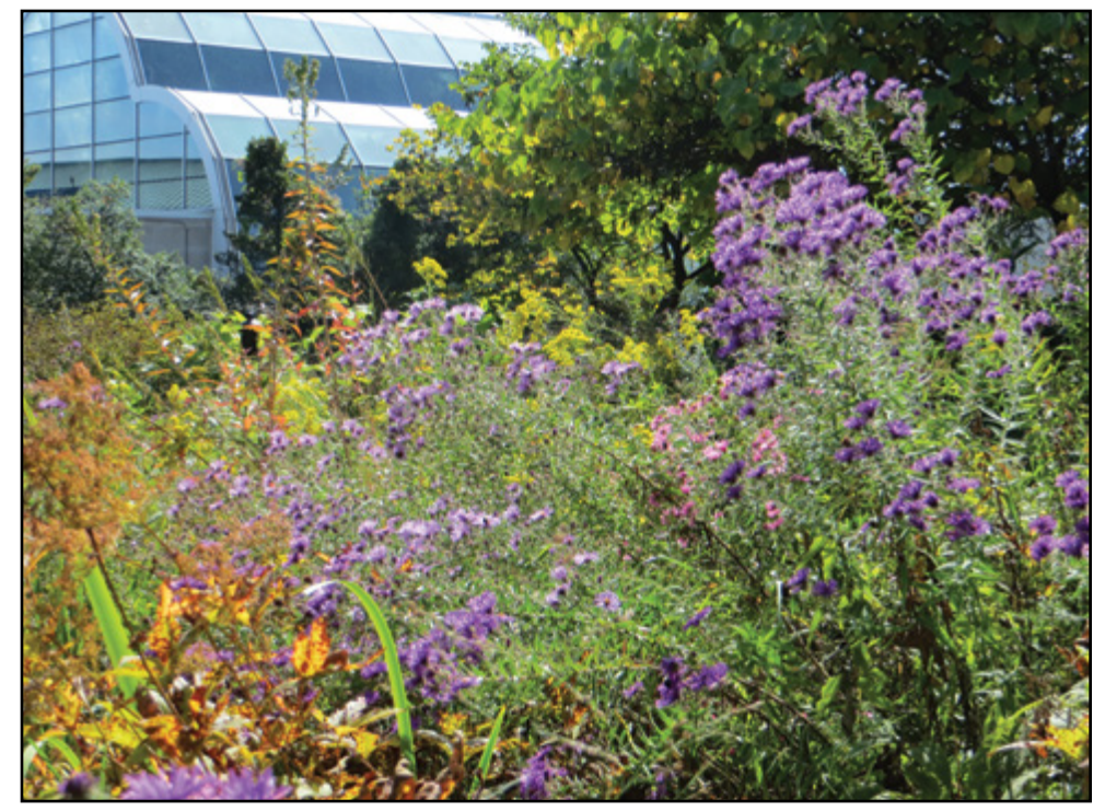
The beautiful native garden at the Sophia M. Sachs Butterfly House

Step into the wonder and beauty of butterflies, insects, spiders and their other many-legged friends! Your little bugaboos will be able to play games, create spooktacular crafts and take home lots of loot after they visit the many Treat Houses. Hand-painted Treat Houses will be sprinkled throughout our outdoor Butterfly Garden. Little Ghosts and Goblins will also be able to spy on the amazing Owl Butterfly, which are only active during dusk and dawn. Admission into the Butterfly House, activities, crafts, treats and goody bags are included in the event ticket price. Reservations required.