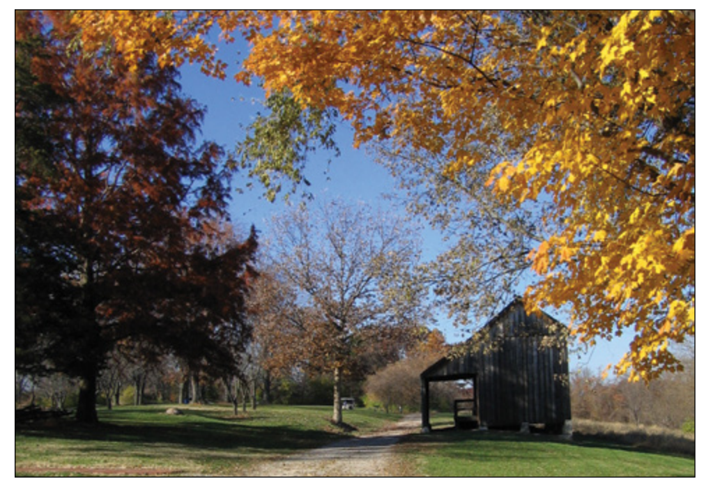
Faust Park in it's fall glory.