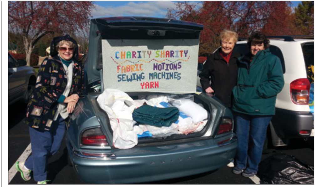
Charity Sharity returns to Recycles Day event to collect fabric and sewing necessities.

For more information call 314.382.1650 x.13, or visit witsinc.org.